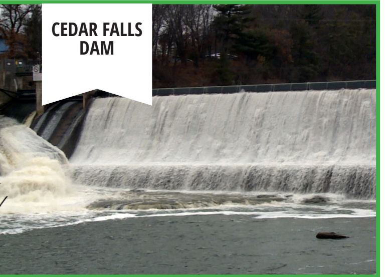
CEDAR FALLS DAM