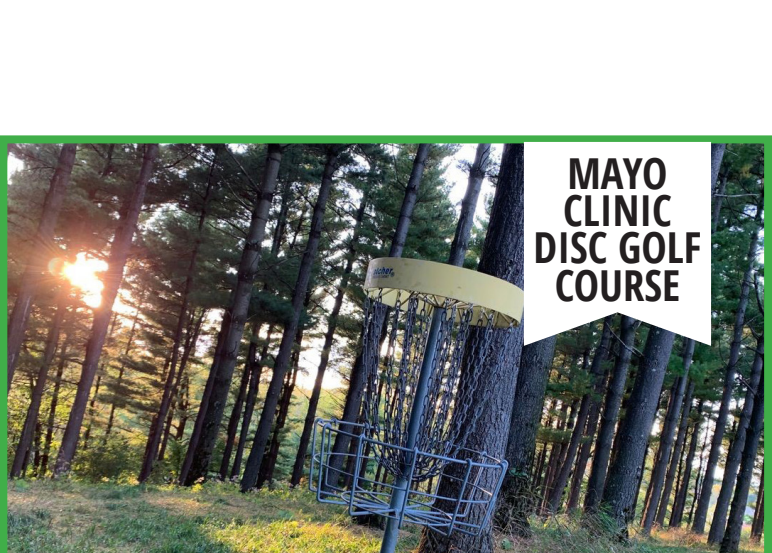
MAYO CLINIC DISC GOLF COURSE