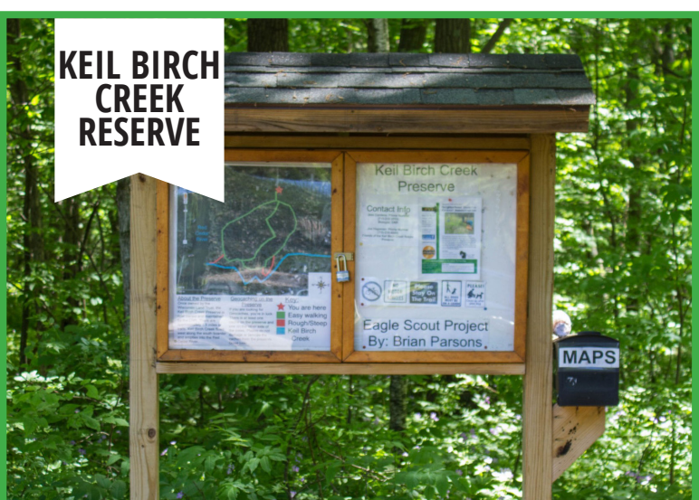
KEIL BIRCH CREEK RESERVE AFTERNOON \\\ TAKE A RELAXING STROLL THROUGH ONE OF MENOMONIE'S HIDDEN GEMS! ENJOY NATURE AND THE SOUND OF THE RED CEDAR RIVER