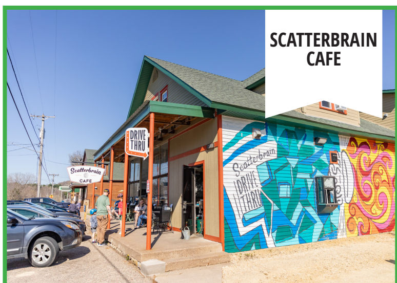
SCATTERBRAIN CAFE MORNING \\\ ENJOY BREAKFAST STARTING AT 8:00AM OUTSIDE OR IN THE DINING ROOM WHERE YOU CAN ENJOY A BIT OF DUNN COUNTY HISTORY