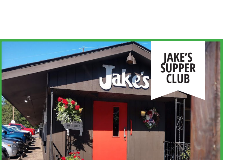
JAKE'S SUPPER CLUB