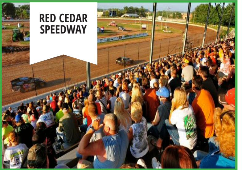
RED CEDAR SPEEDWAY