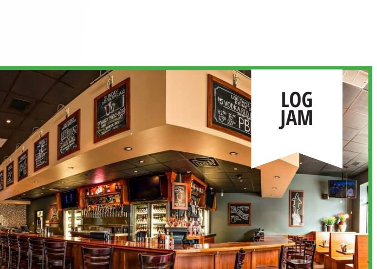
LOG JAM EVENING \\\ HAVE A CLASSIC WISCONSIN FISH FRY AND MADE-FROM-SCRATCH SOUP OF THE DAY!