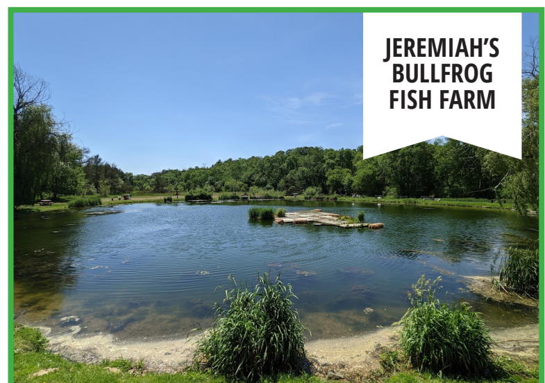
JEREMIAH'S BULLFROG FISH FARM AFTERNOON \\\ OFFERING A UNIQUE TROUT FISHING EXPERIENCE ON THIS LOCAL FARM. MAKE SURE TO TAKE HOME SOME TROUT SPREAD AND THEIR SPECIAL FISH SPICE!