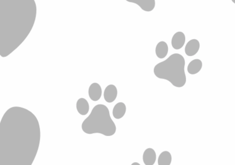
ELLSWORTH COOPERATIVE CREAMERY