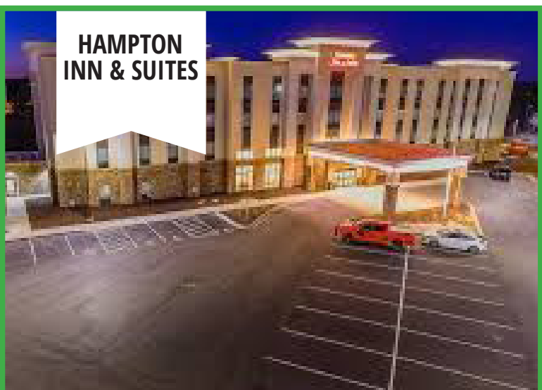
HAMPTON INN & SUITES WHERE TO STAY \\\ REST UP FOR LONGER DRIVES FOR ARTS AND HERITAGE DAY!