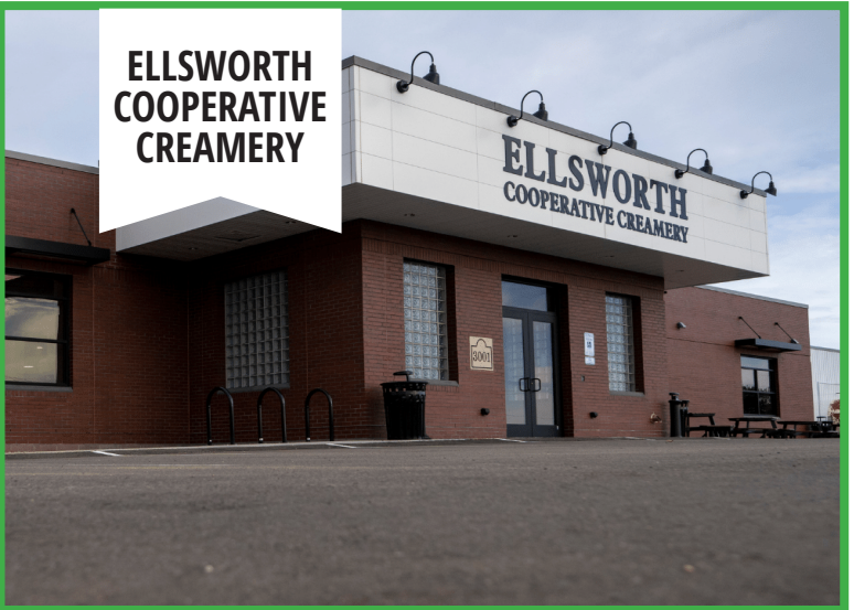
ELLSWORTH COOPERATIVE CREAMERY SWEET TREAT \\\ STOCK UP ON LOCAL SNACKS AND ENJOY ICE CREAM ON THE PATIO OR BACK ON THE ROAD