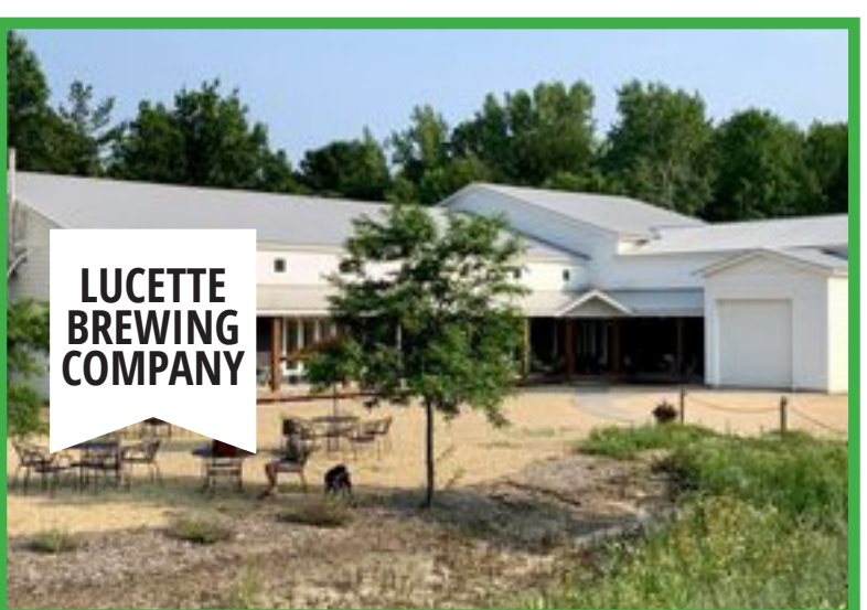
LUCETTE BREWING COMPANY EVENING \\\ GORMET BRICK OVEN PIZZA AND BEAUTIFUL OUTDOOR SEATING