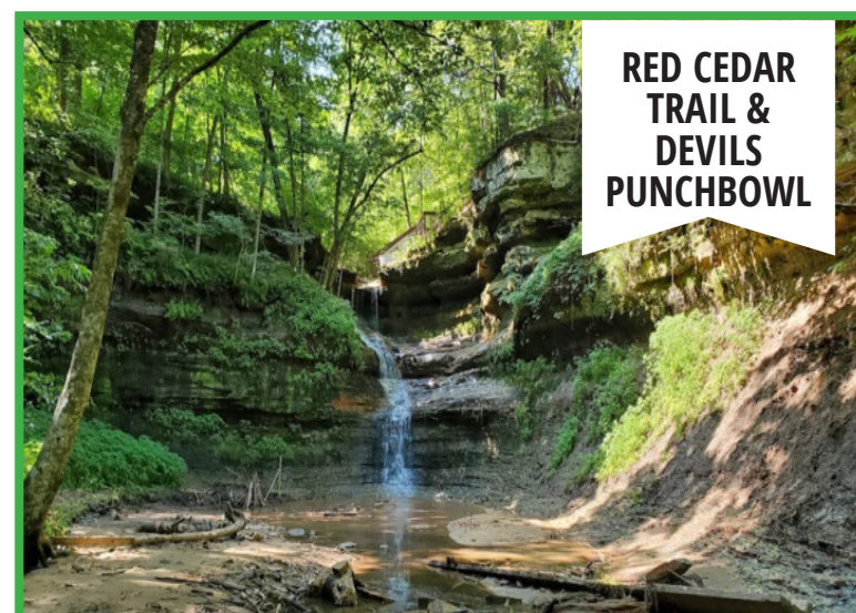
RED CEDAR TRAIL & DEVILS PUNCHBOWL MORNING \\\ START THE DAY WITH A MORNING HIKE DOWN THE RED CEDAR TRAIL OR HEAD OVER TO THE DEVILS PUNCHBOWL