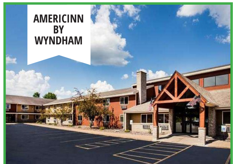
AMERICINN BY WYNDHAM WHERE TO STAY \\\ CONVENIENTLY LOCATED RIGHT OFF I-94 WITH A POOL THE WHOLE FAMILY CAN ENJOY