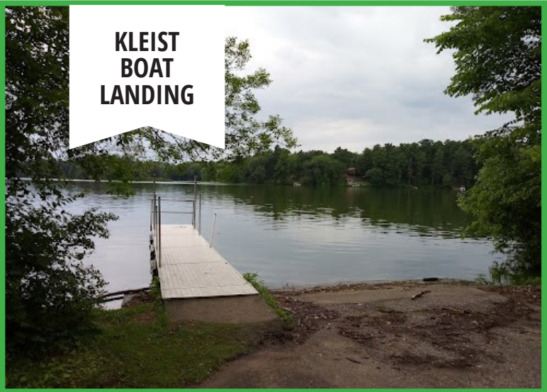
KLEIST BOAT LANDING