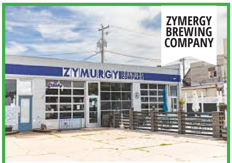
ZYMERGY BREWING COMPANY AFTERNOON \\\ CALM AND RELAXING WITH THE OCCASIONAL HEAVY METAL CONCERT. FIND A ROTATION OF FOOD TRUCKS FOR A MID-DAY BITE!