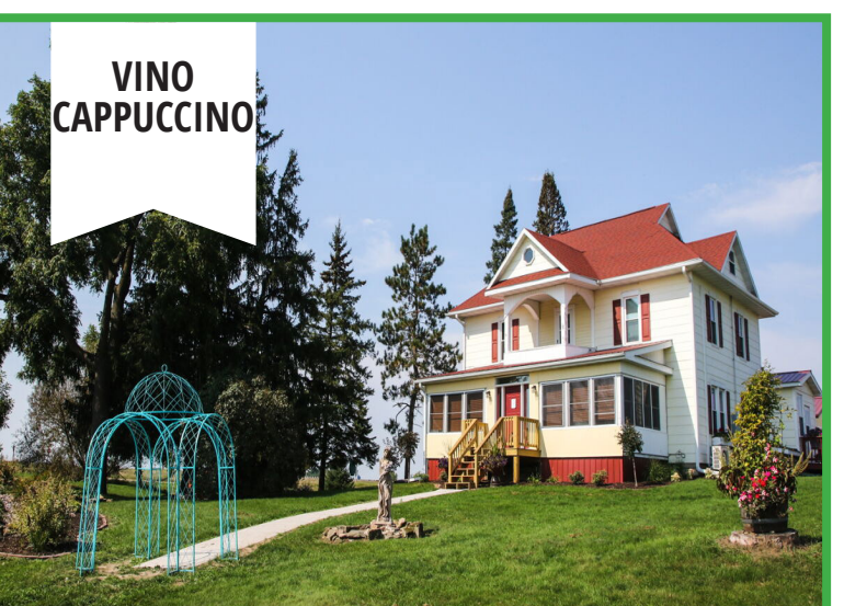
VINO CAPPUCINO AFTERNOON \\\ ENJOY PIZZA, DESSERT, WINE AND LIVE MUSIC ON THE PATIO/GRASS!