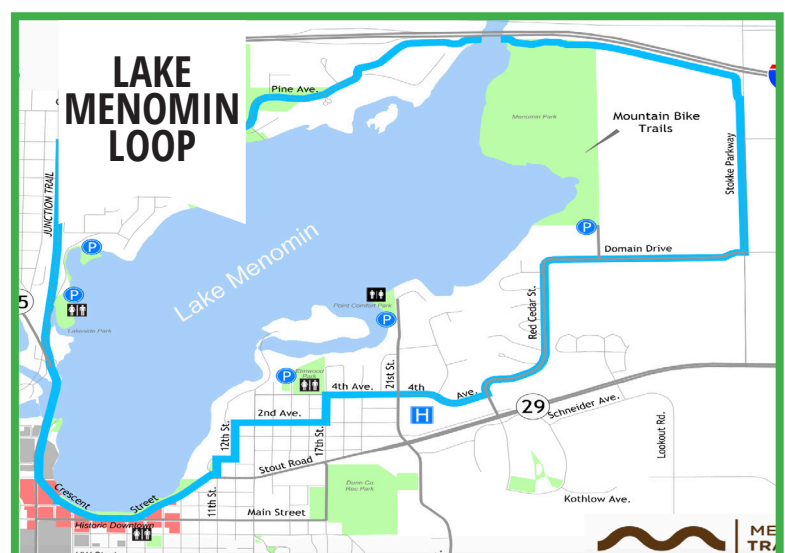
LAKE MENOMIN LOOP GET MOVING \\\ ENJOY 8.3 MILES OF PAVED TRAIL TO WALK OR BIKE AROUND LAKE MENOMIN