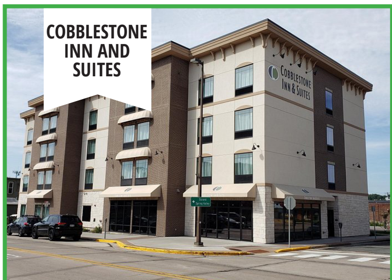
COBBLESTONE INN AND SUITES WHERE TO STAY \\\ CONVENIENTLY LOCATED RIGHT IN DOWNTOWN MENOMONIE