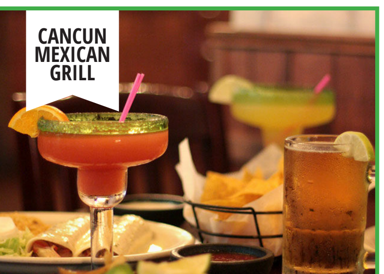
CANCUN MEXICAN GRILL AFTERNOON \\\ STOP FOR AFFORDABLE LUNCH SPECIALS AND MARGARITAS ON THE OUTSIDE PATIO