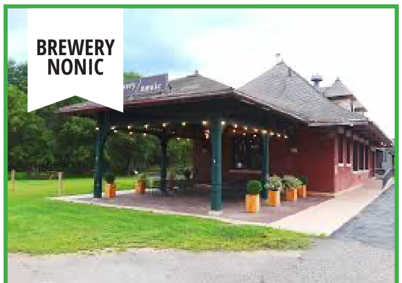
BREWERY NONIC MORNING \\\ GOURMET SUNDAY BRUNCH WITH CHEF STACY